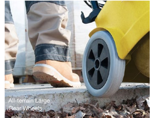
All-terrain Large Rear Wheels