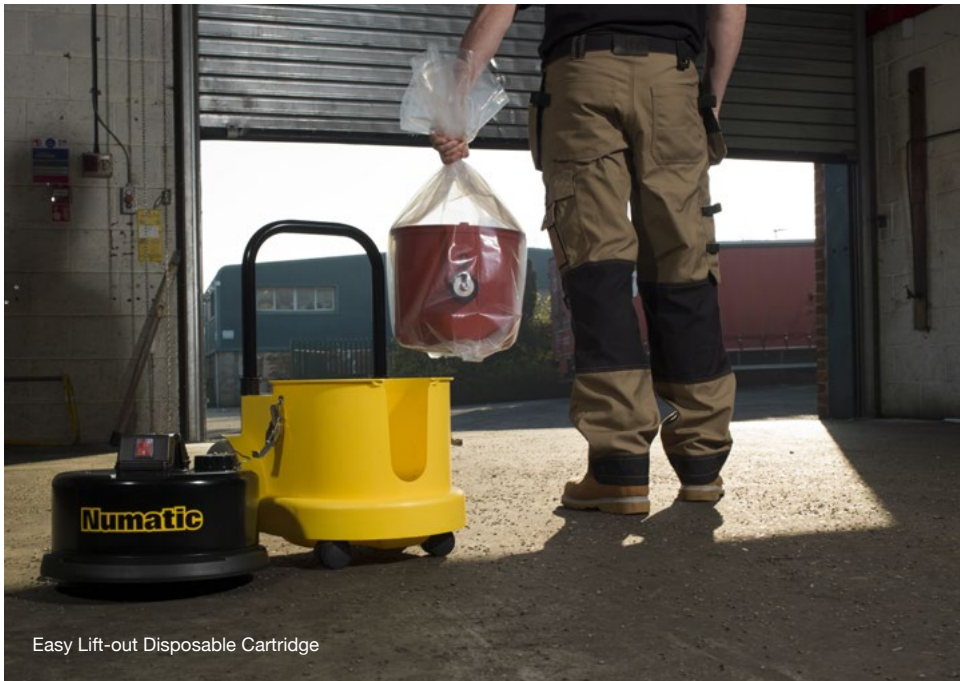
Easy Lift-out Disposable Cartridge