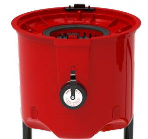
H3C Disposable Cartridge HEPA H13 Filter conforms to EN1822. Fits all H3C machines.