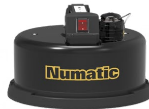
All-Steel Head Heavy-duty power head.

With a compact, 390 container design and folding pull handle (H3C390L only), the H3C can be neatly stored away, ready when you need it.