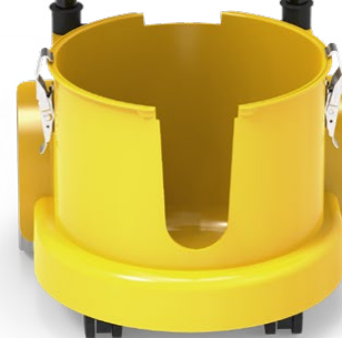
Robust Drum Tough drum construction with all-terrain large rear wheels for stairs and uneven surfaces.