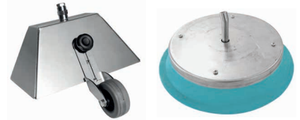
Weed killing conveyor