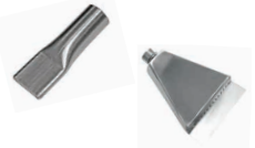
Flat nozzle 1cm