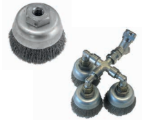
Stainless steel brushes T50