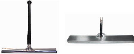
Window cleaner w/diffuser - Steam brush w/bristles