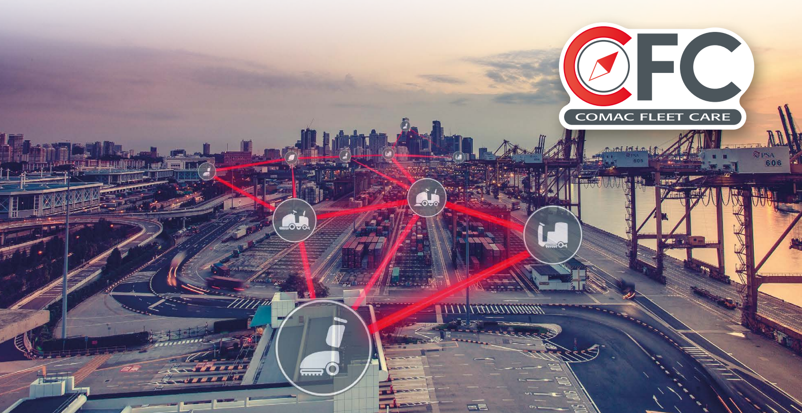
VISPA XL TECHNOLOGIES