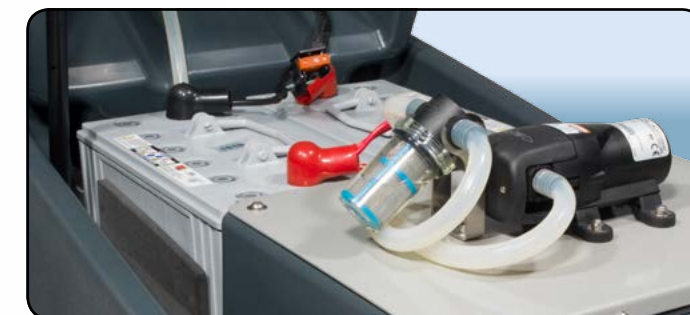
Easy battery and filter access