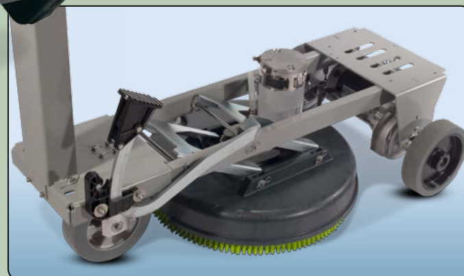
Heavy duty integral chassis (CRO8055G shown)