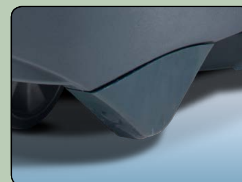
Anti-tip side buffers