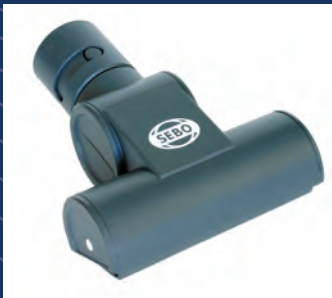
SEBO Turbo Brush