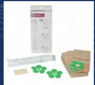
SEBO Service Box