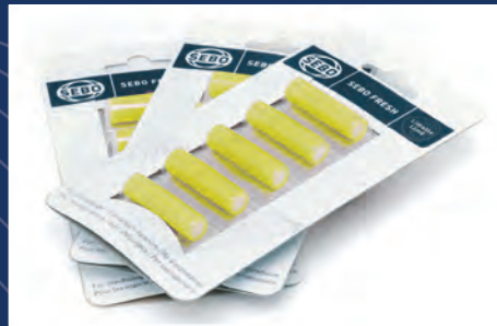
SEBO Air Fresheners