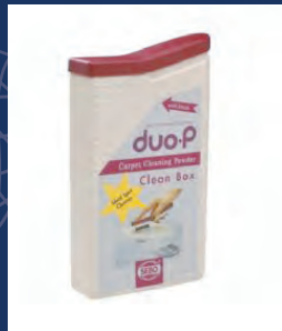
SEBO duo-P Clean Box