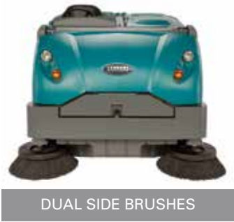
DUAL SIDE BRUSHES

Travel between work sites safely and quickly with the S30 X4 configuration that travels up to 24 km/h on a stable 4 wheel platform with comfortable suspension.