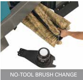
NO-TOOL BRUSH CHANGE

Achieve outstanding results in diverse environments with dual side brushes which allows you to sweep a path of 2,032 mm in a single pass.