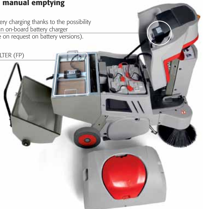
PANEL FILTER (FP)

Easy battery charging thanks to the possibility to have an on-board battery charger (available on request on battery versions).