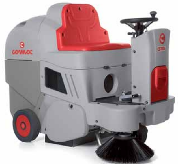
CS700 B With manual emptying