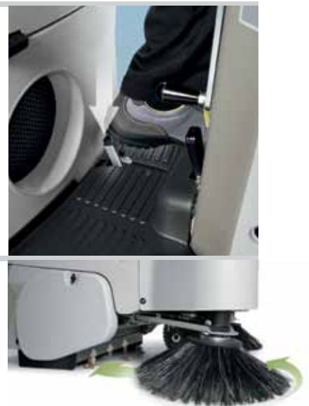
CS800 H With automatic emptying at height

Flap lifting device, activated by a pedal, making it easier to pick up coarse dirt