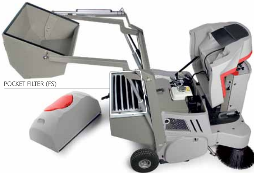
POCKET FILTER (FS)