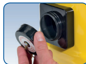
Transit safety cap top and bottom

Our high efficiency system ensures superb operational performance using either HepaFlo or MicroFlo dust bags.