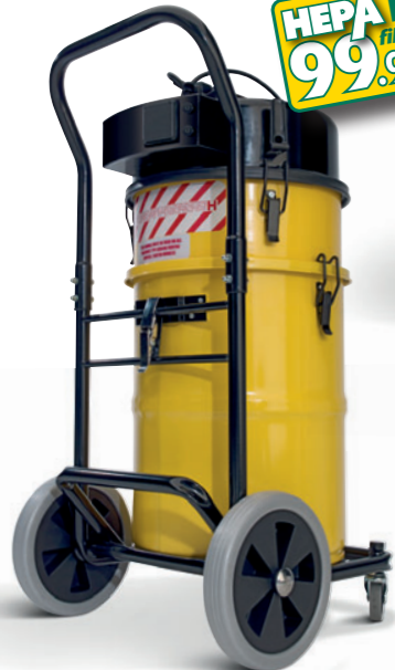
Heavy duty steel chassis

Heavy duty all steel chassis release system.