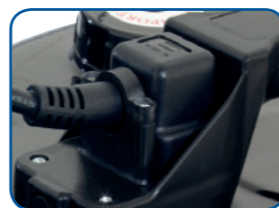
NuCable allows easy cable replacement

info@ccequipment.com.au www.ccequipment.com.au