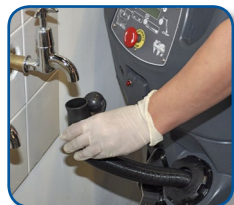
Flexifill 1m easy filling hose