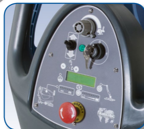
Nutronic control panel TTB6055T shown