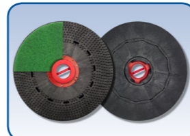
36/40/50cm PadLoc pad drive system