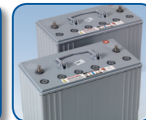
2x Fully sealed gel batteries