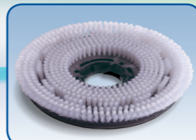
55cm Light duty scrubbing brush

Our full range of machines is complemented by an extensive range of brush specifications in order to ensure the highest standards and optimum results in use providing floors you will be proud of.