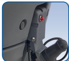
Plug-in charger system