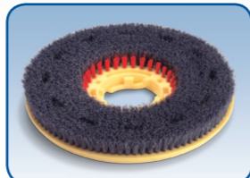
55cm Long life light duty scrubbing brush