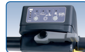
Nutronic operational control

Both 4055 models are true workhorses providing exceptional efficiency, easy user friendly operation and stable handling wherever they are used.