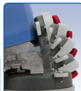
DeckLoc tilt mechanism