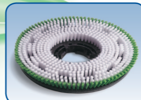
40/45/55cm Heavy duty scrubbing brush