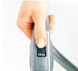
Finger Tip Speed Control