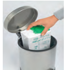
Hygienic Debris Disposal

BOOK A FREE DEMONSTRATION +618 9249 8744