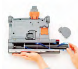
Tool Free Brush Access