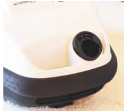
Patented Soft Airbelt Bumper