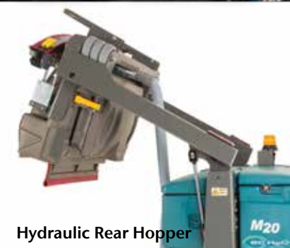
Hydraulic Rear Hopper