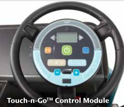
Touch-n-Go™ Control Module

▶ Touch-n-Go™ control module with 1-Step™ start button allows operators quick access to all settings without removing hands from the steering wheel.