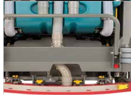
Yellow Maintenance Touch Points