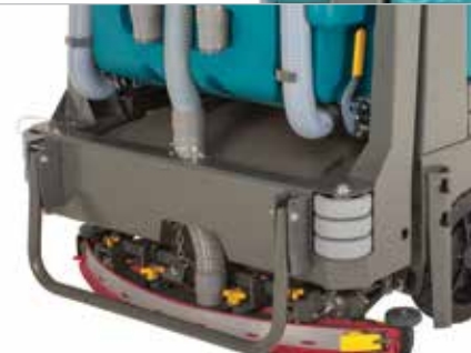
Dura-Track™ Parabolic Squeegee

Overhead guard protects operators from falling objects.