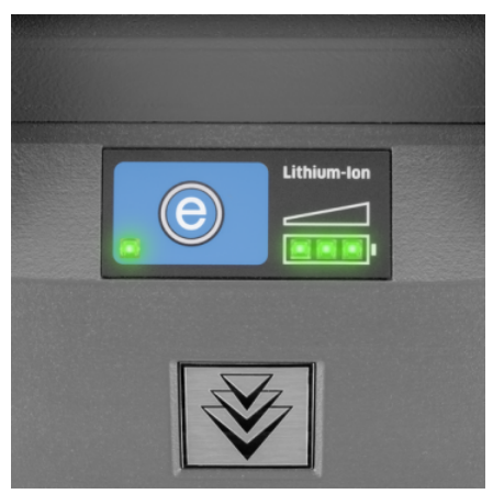
Economical and efficient eco!efficiency mode