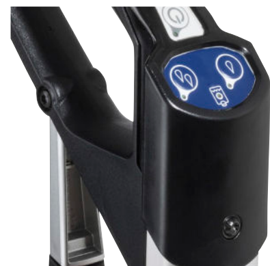
You will remain in full control of the scrubber dryer thanks to the intuitive touch display with two water settings and a solution indicator, alerting you if the tank is empty