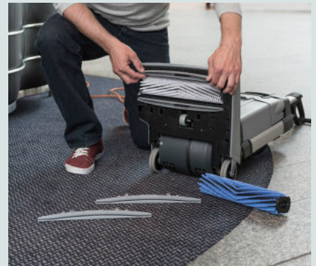
Apart from getting faster cleaning of hard floors, you will also be able to freshen up smaller carpets, including removal of spots, by adding an optional carpet kit. Brush and squeegees can be removed without any tool making daily maintenance operations easy and fast