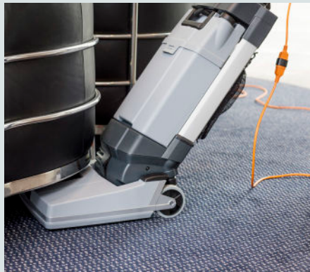
The SC100 clean in a position height of just 25 cm