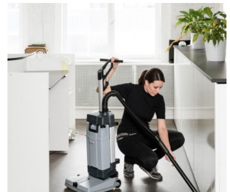
The optional manual suction hose is ideal for cleaning any unreachable area or spot cleaning.