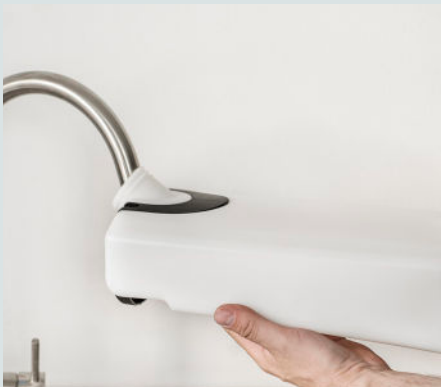
Easy to fill the solution tank with water in any low sink