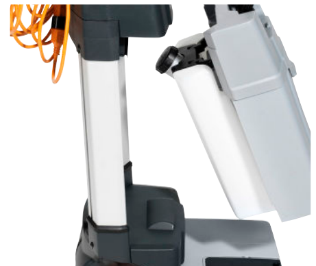
Each tank can be removed quickly and carried in one hand.