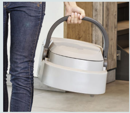
Tank-in-tank design for easy handling when emptying and refilling