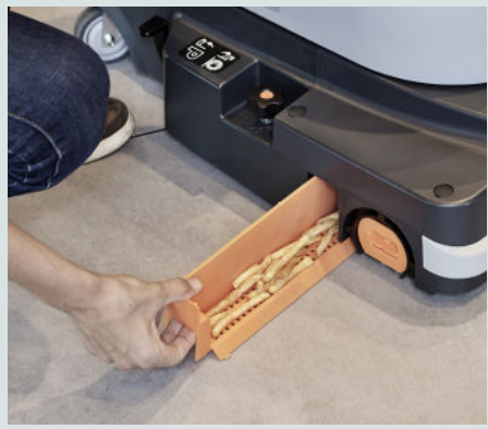
Easy access to emptying and cleaning the debris tray