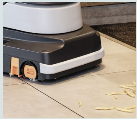
Easy pick-up of larger debris as front squeegee can be lifted