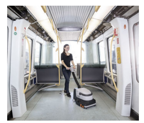
Easy to maneuver thanks to its pivoting wheels and the ergonomic adjustable handle