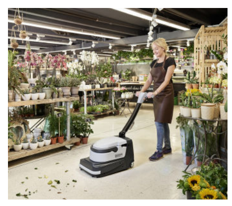
Cleaning floors with ease and speed - sweep, scrub and dry at the same time