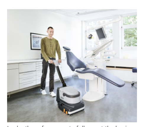
In-depth performance to fully meet the hygiene standards of clinics and hospitals