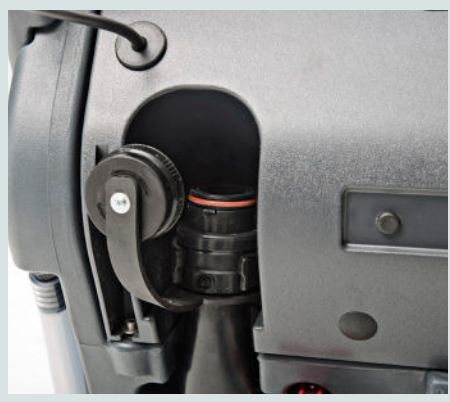
You get drain hose with soft, squeezable section enabling manual flow control, and curved squeegees for better performance and drier floors