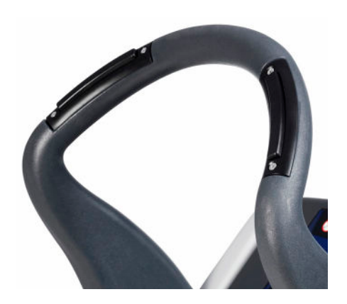
You have a safety switch practically placed on the handle for your convenience