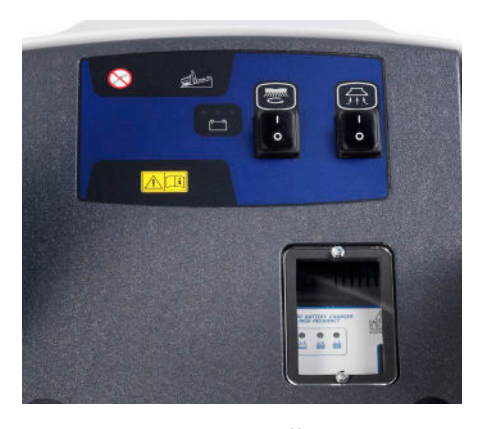
As easy as can be: You can effortlessly operate the SC450 by two buttons and a switch only