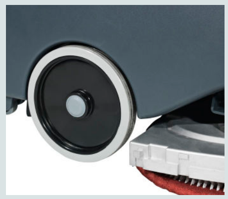
Adjustable machine deck and 34 kg down pressure for heavy-duty tasks offer you the best opportunities for all round cleaning