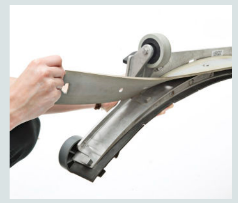
You are able to use the squeegee blades on both sides thus saving costs. And changing is easy. You don't need any tools