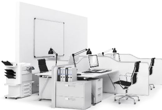
BUILDING SERVICE CONTRACTORS