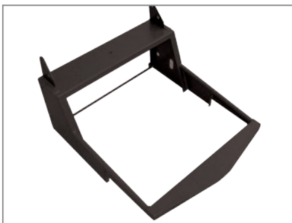
STEEL FRAME STRUCTURE