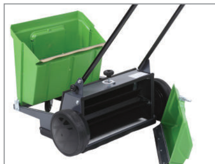
EASY ACCESS TO ALL COMPONENTS