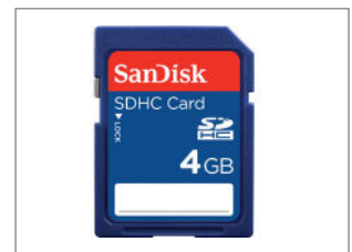
MEMORY CARD FUNCTIONALITY*