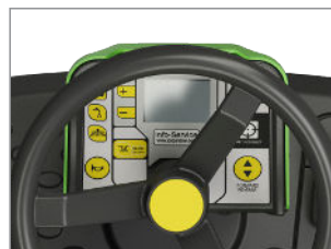
PRESET WORKING PROGRAMS